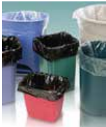
Linear Low Density Can Liners