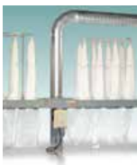
Low Density 55 Gallon Drum Liners