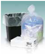
Dust Collector Bags