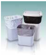
High Density Can Liners - Loose Pack Dispensers