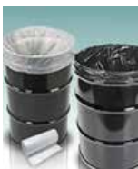
Low Density Poly Liners