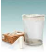
High Density Can Liners - Coreless Rolls